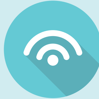
Cable, telephone & Internet