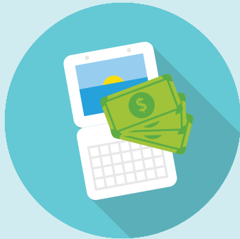
First & last month's rent